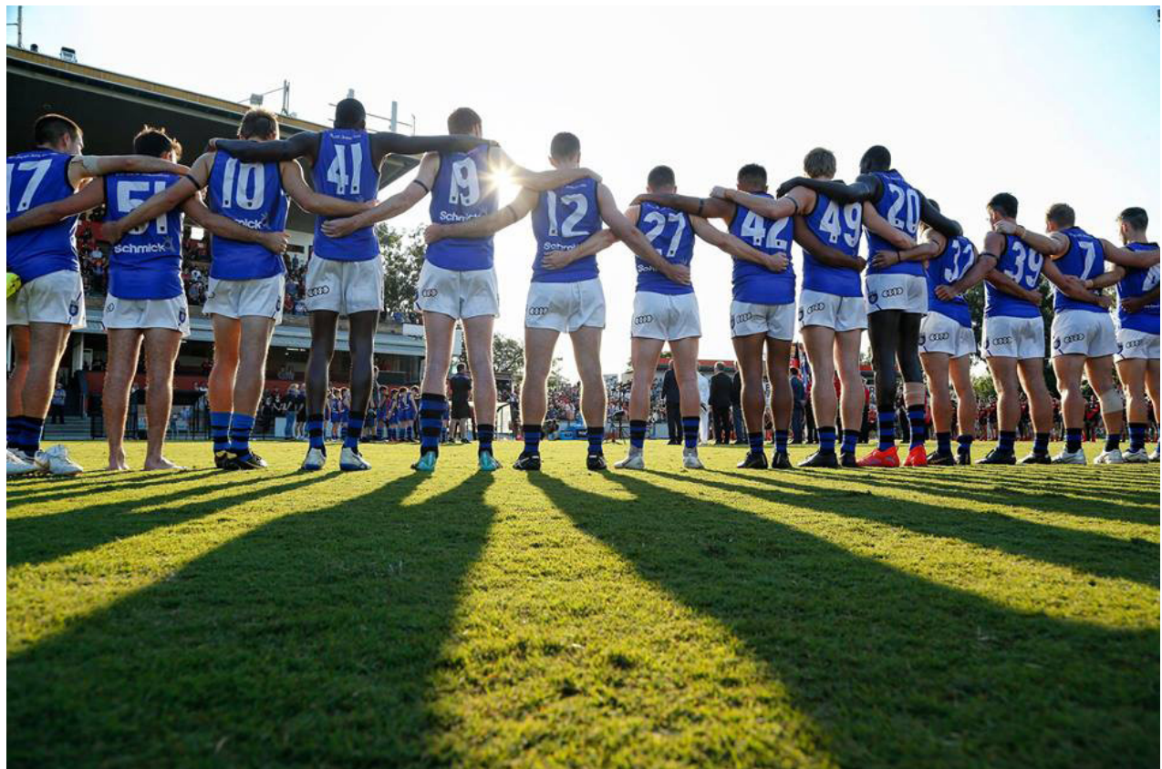
Arm in Arm on ANZAC Day vs Perth