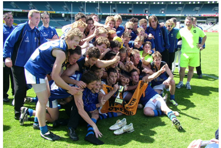
Above: The 2006 Colts Premiers Below: The 1967 Fourths Premiers