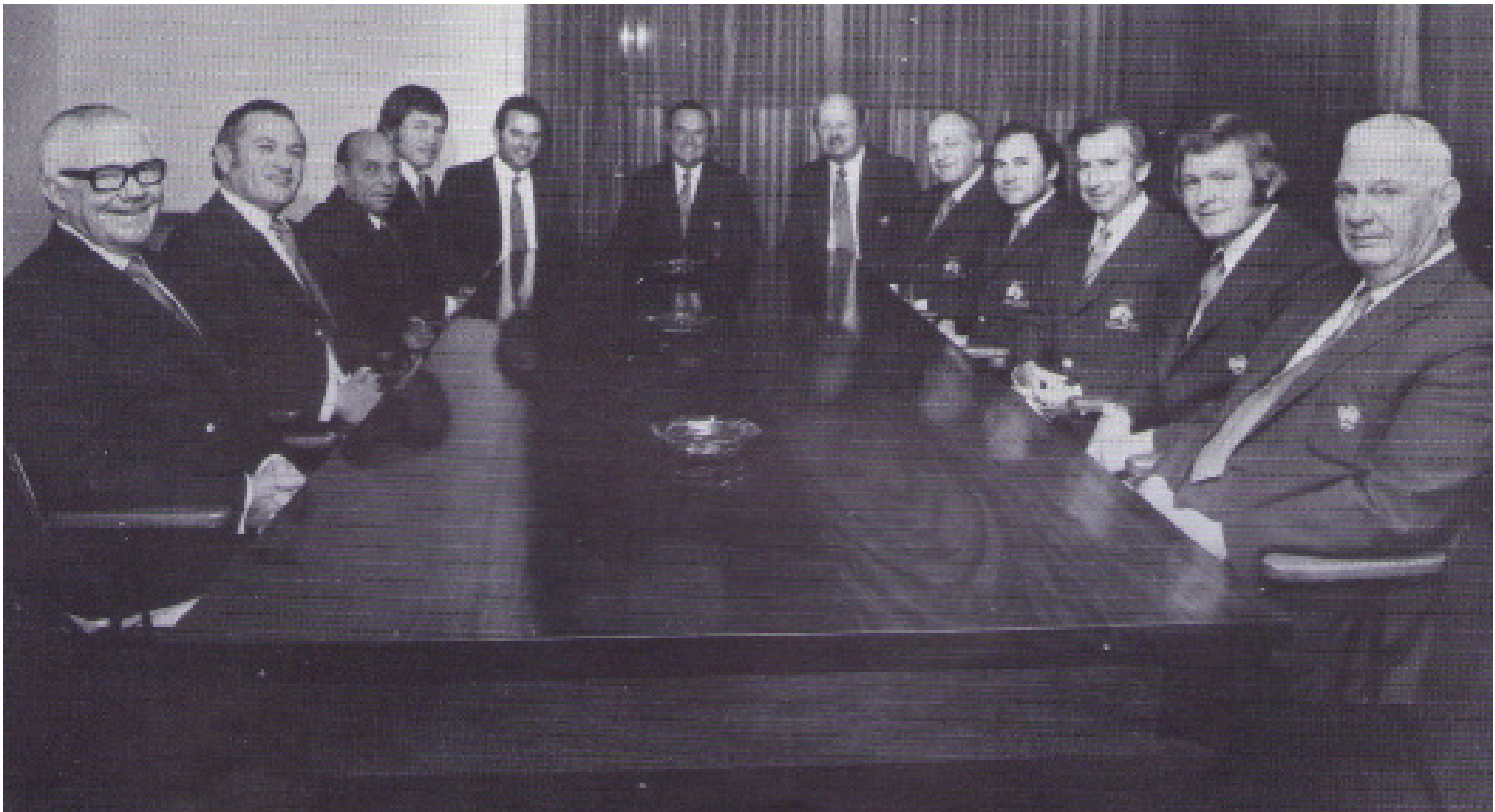
The last East Perth Committee 1975. In 1976 the club moved to a Board for the running of administration